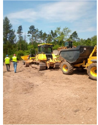
Pictures 15, 16 and 17 - in these places there will be a training polygon...