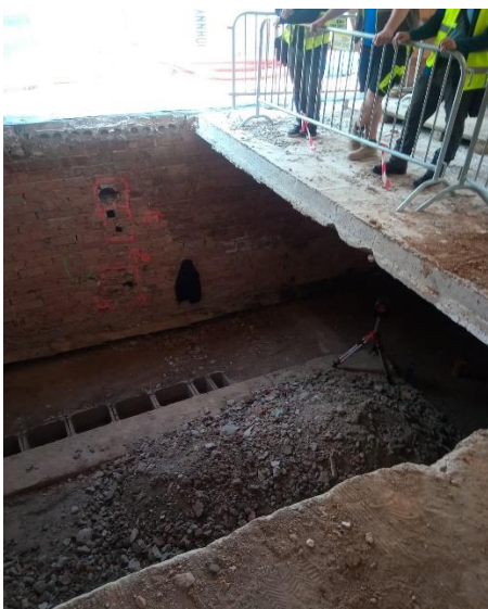
Picture 14 - The cellar of the conference hall will be transformed into sanitary facilities...