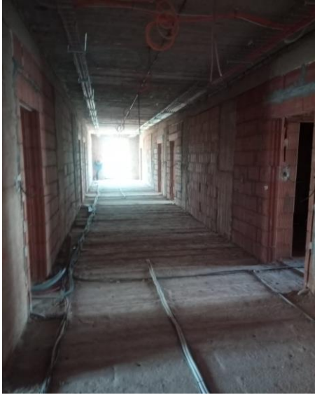
Picture 11 - Corridor with future rooms for participants of activities...