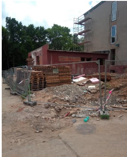
Pictures 1 and 2 - Reconstruction of the entrance to the complex and the gatehouse...