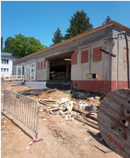
Picture 12 - Conference hall ...